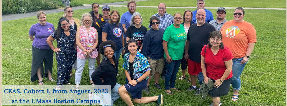
CEAS, Cohort 1, from August, 2023 at the UMass Boston Campus

We The People: Civics that Empowers All Students is a federally funded project of the Center for Civic Education that supports effective educator development through our flagship curricular program: We the People: The Citizen and the Constitution.